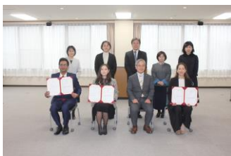
[ Teacher Training Student Completion Ceremony ]