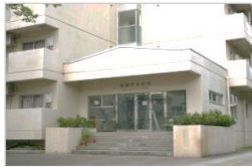
[ International House ]