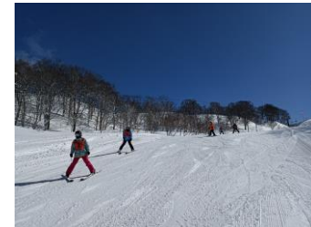
[ Ski Experience ]