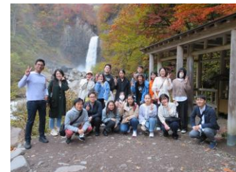
[ Japanese Culture and History Experience ]