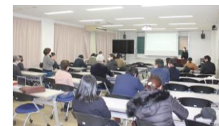
[ Presentation of Research Result ]

Although it varies depending on their academic supervisor, students will generally receive thesis guidance from their supervisor once a week, lectures on approximately 4 subjects per week (including supplementary Japanese language classes), and practice at school approximately two days per week. At the time of completion, students will be required to present the results of one year research under the guidance of their academic advisor and Japanese language instructors, and submit a completion report (approximately 30 pages).